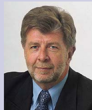
“Budget 2010 looked to the future... so that New Zealand comes out of the downturn in a better position to create jobs, grow productive firms, and attract investment.”

I wish you well in your business endeavours.”