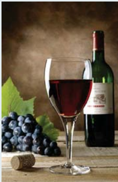
“... selling premium wine is about trust!”