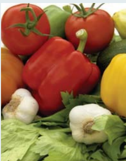
Exemption from GST called for so-called ‘healthy’ foods not a workable regime.